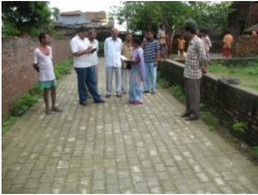
Interlocking Road GP- Jogapur Block-Sadar Distt- Pratapgarh. UP