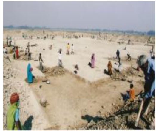
PondConstruction GP- Lakhanpur Soor Block-Sangipur Distt- Pratapgarh. UP