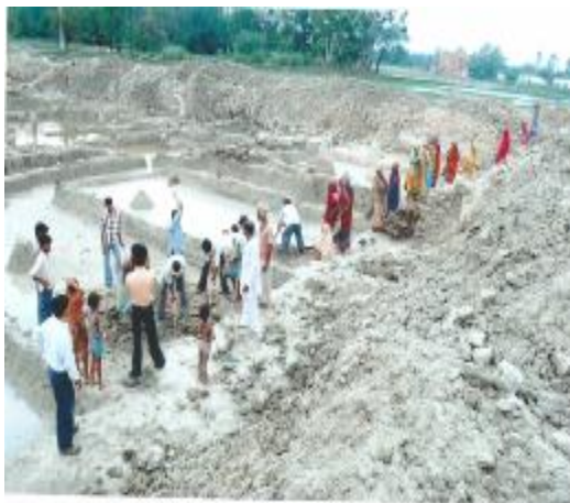
digging Pond GP- Saraisaid Khan Block-Bihar Distt- Pratapgarh. UP