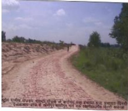
Kharanja Construction GP- Pingari Block-Kunda Distt- Pratapgarh. UP