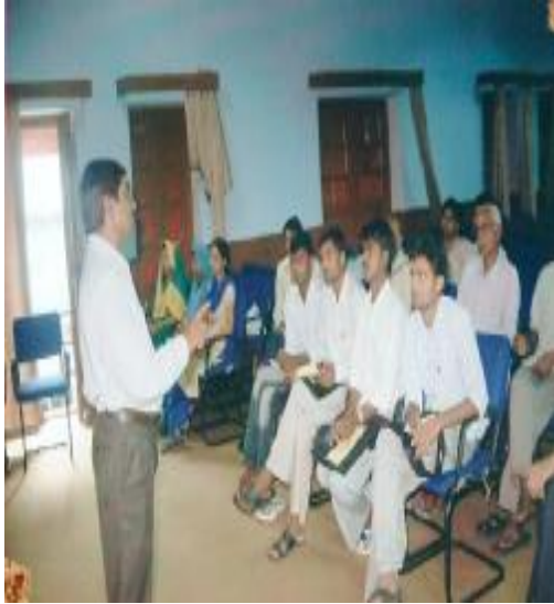
Training of Gram Rojgar Sewak at Training Centre. Distt- Pratapgarh. UP