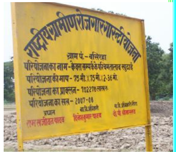
Display Board at Work Site Distt- Pratapgarh. UP