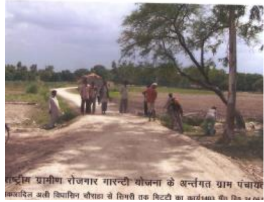
Kachha SM Construction GP- Chakadarali Block-Kunda Distt- Pratapgarh. UP