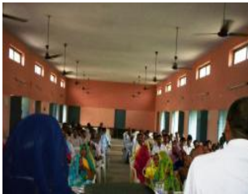
General Awareness at Block Level Distt- Pratapgarh. UP