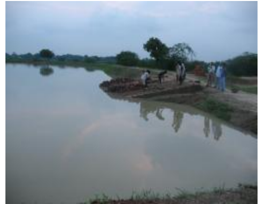
Pond GP- Pratapgarh Gramin Block-Sadar Distt- Pratapgarh. UP