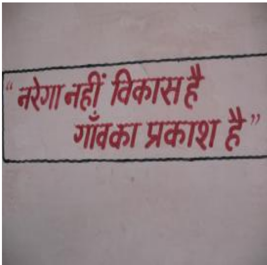
Wall Writing on Govt. Building