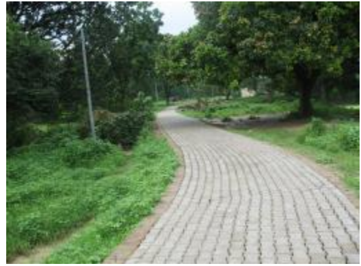
Interlocking Road GP- Pure Hiravan Block-Sadar Distt- Pratapgarh. UP