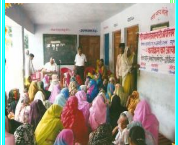
General Awareness at Village Level Distt- Pratapgarh. UP