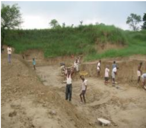
Bandha Construction GP- Jogapur Block-Sadar Distt- Pratapgarh. UP